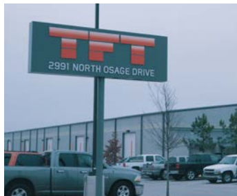
Tulsa Fin Tube